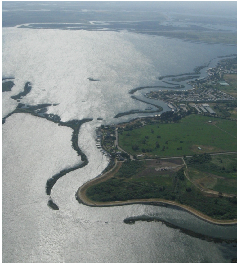
Frank's Tract, May 22, 2009. Large expanses of open water are likely to increase in the Delta, one of the justifications for WaterFix.

On a final note, we emphasize that this analysis is based on what is good for native fishes. It does not take into account socioeconomic problems, urban and agricultural water demands, social welfare of Delta peoples, or other non-biological factors. However, a Delta that supports desirable fishes will likely also support a wide array of ecosystem services, such as fisheries and high water quality, which also benefit people.