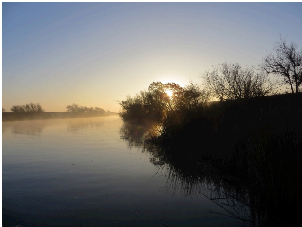
Cache Slough Sunrise.

Appendix E. A Scoring System for Restoration Projects